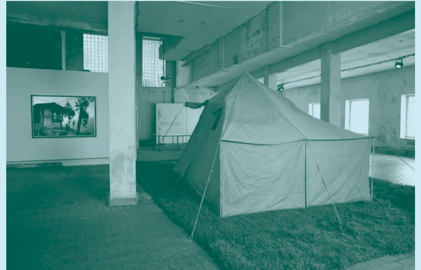
BERGEN KJØTT Photographic Field Trips. Vol 2, Installation view