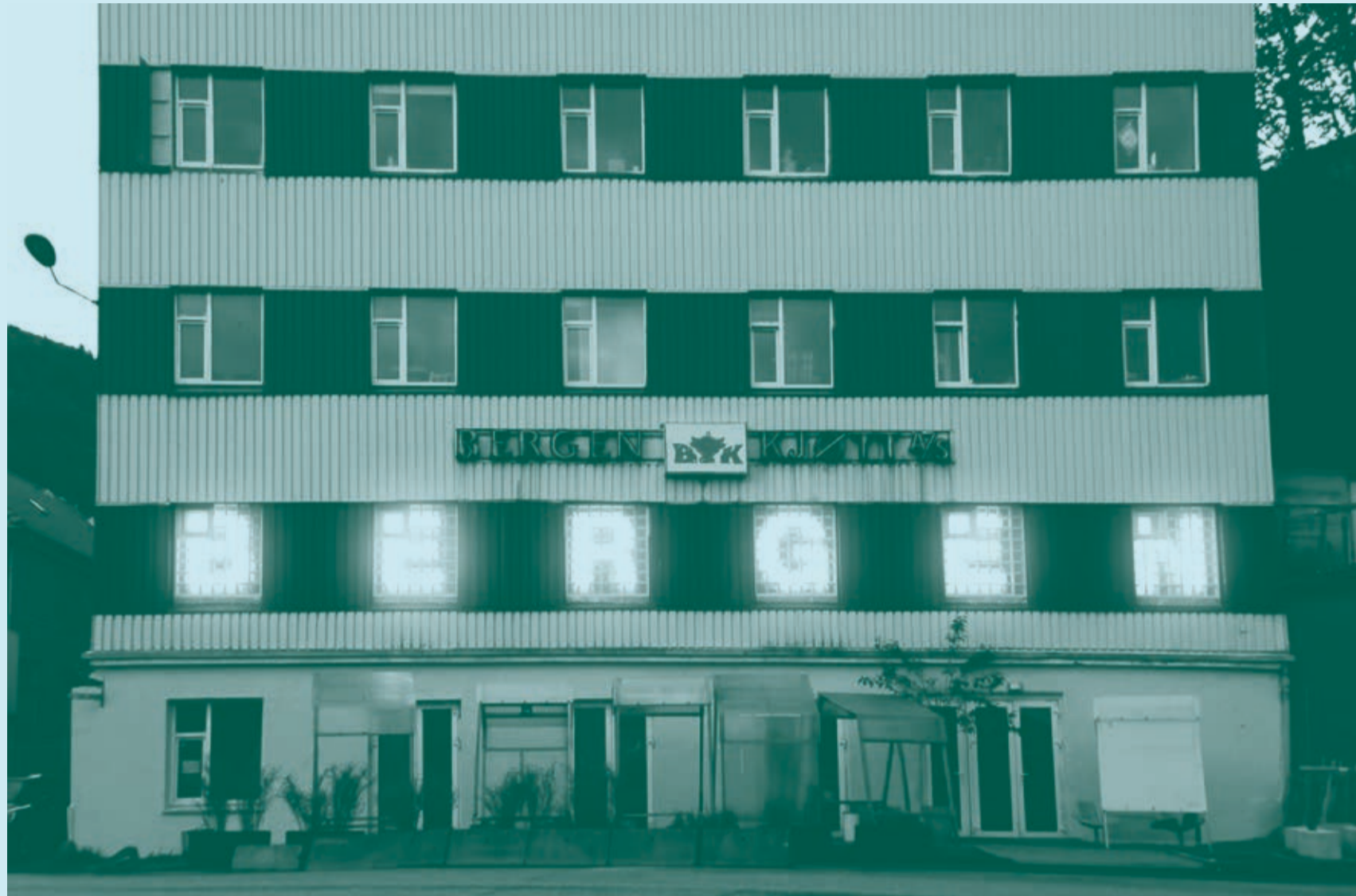
BERGEN KJØTT Bergen, Norway 2017